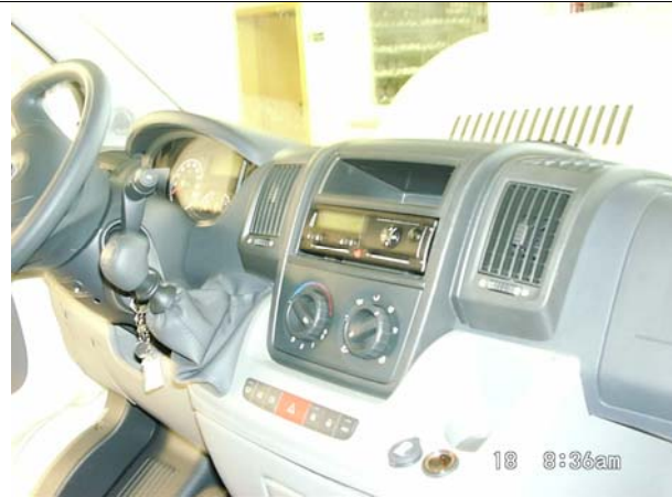
In the radio compartment